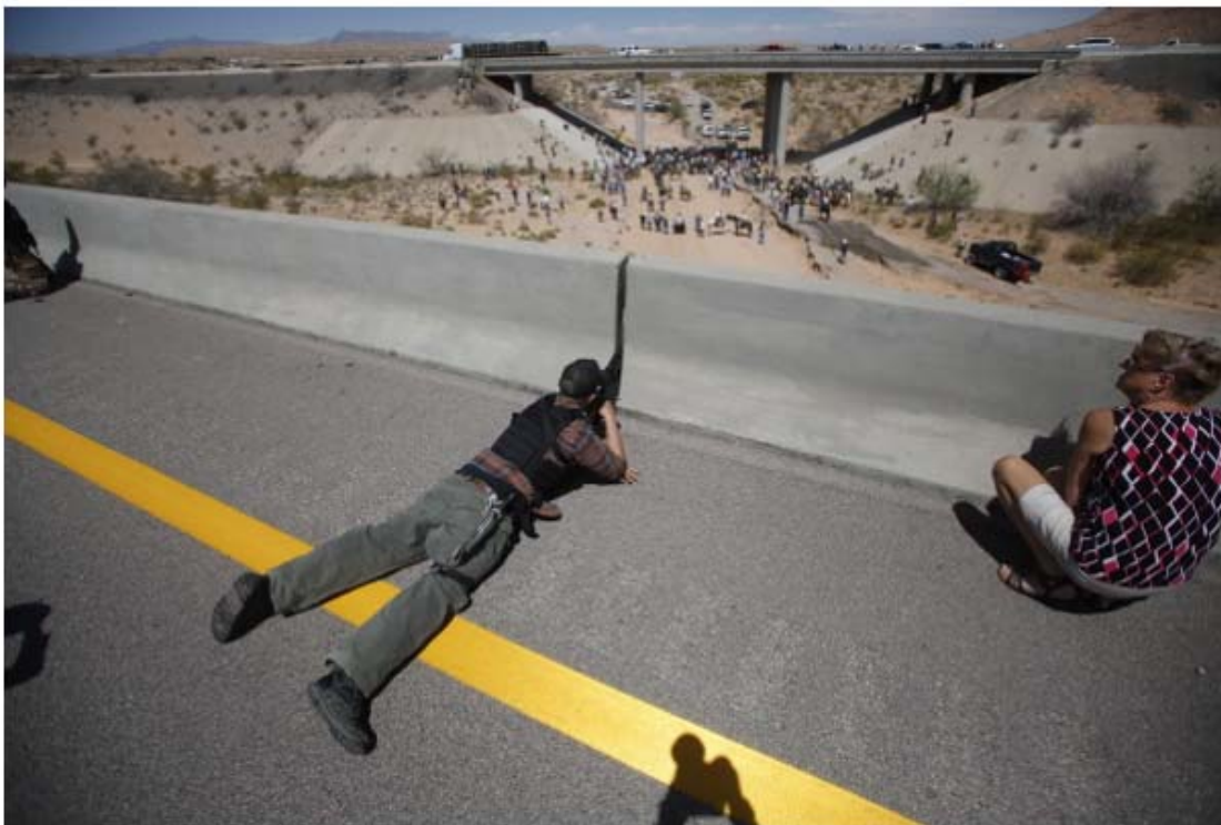
Trial 1 Gov't Exh. 449 (admitted, CR:1828, at 193-94).